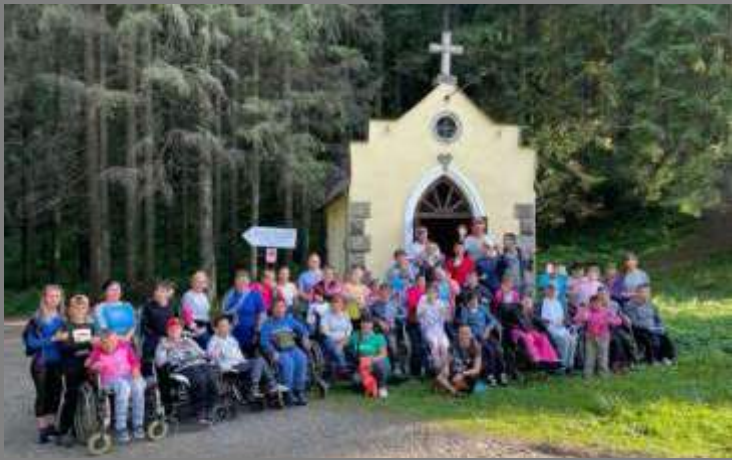
Ukraine (pre-war): Retreat for disabled residents of the Zaluchansk orphanage and boarding school