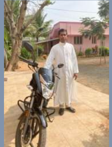
India: Three motorbikes for DePaul Seminary, St. Joseph Church and Sountham Social Service