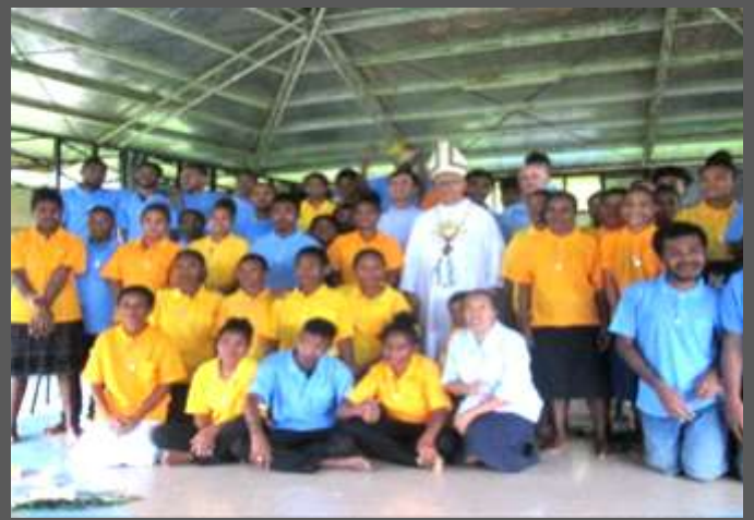
Papua New Guinea: Training of lay missionaries for pastoral projects