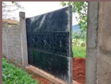
Cameroon: Construction of a gated wall for St. Vincent DePaul Yaoundé Major Seminary