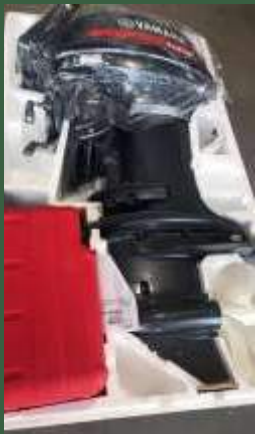
Honduras: Purchase of a 40-horsepower engine for pastoral visits to the 32 communities in the Santa Cruz Parish