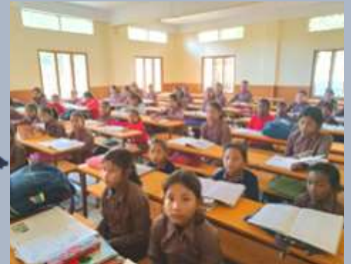
India: Furnishing the girl's hostel at Klurdung, Assam