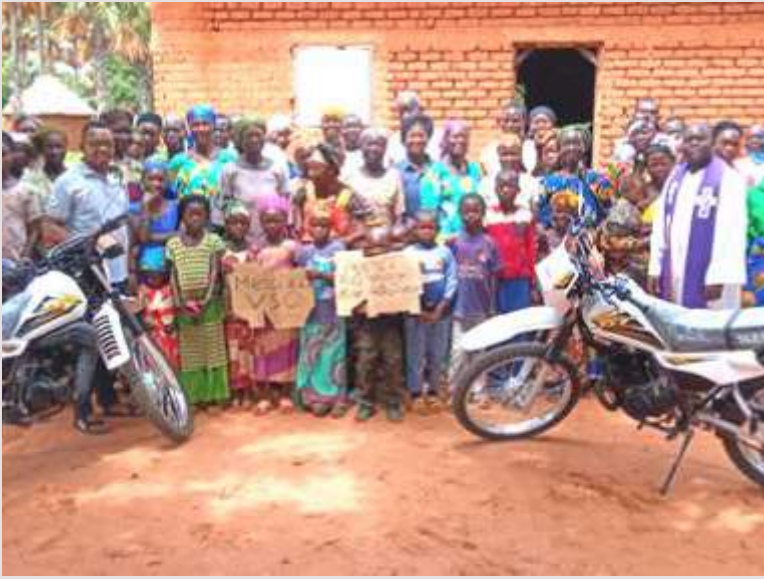
Chad: Purchase of three motorbikes for the Parish Mission of Bebalem