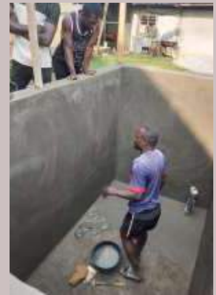
Cameroon: Construction of a fish farm for food security