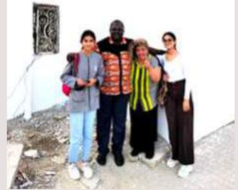
Tunisia: House repairs for elderly neighbors