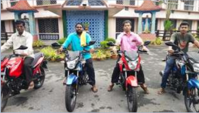
India: Four motorbikes for the socio-pastoral works of the Vincentian Missions at Jubaguda, Kottogodo, Dukuma, and Padangji

These are some of the projects made possible with the help of our collaborators and donors throughout 2021. For even more information on the projects, please visit our website: www.cmglobal.org/vso-en/