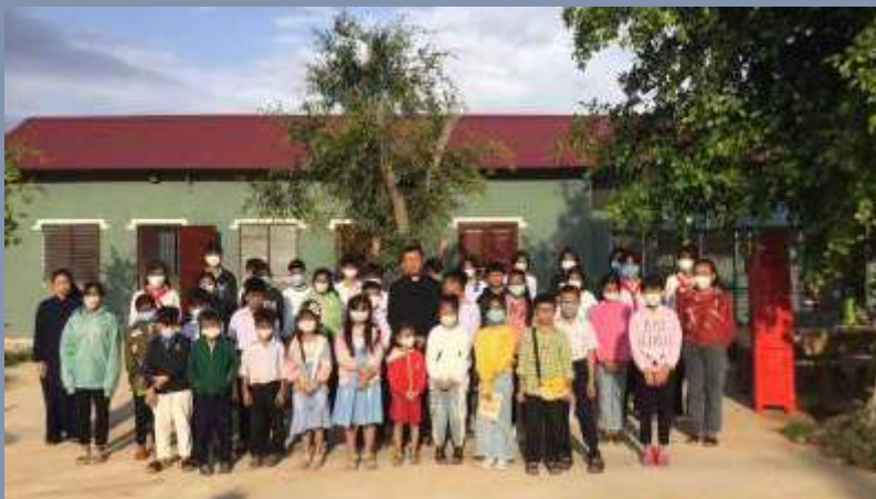
Vietnam: Construction of a pastoral house for catechism class, choir practice, and other community activities