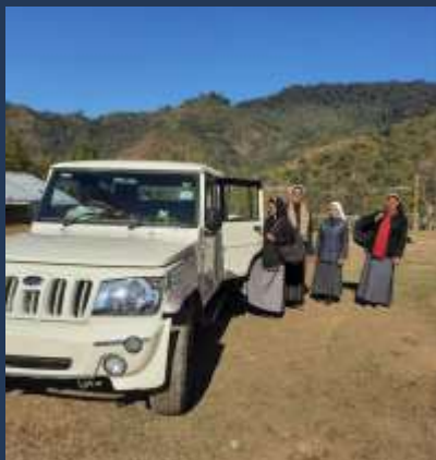
India: Jeep for mission station at Wakka in Arunachal Pradesh, Miao Diocese