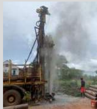
Sierra Leone: Water borehole for school complex

~and many individual contributors, confreres, family and friends of our Vincentian missionaries .