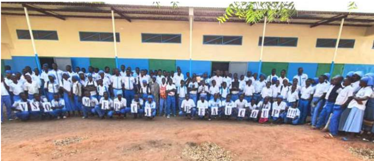
Chad: Construction of a multi-purpose room construction for Lycée Collège St. Jean-Baptiste de Bebalem

Vincentian Solidarity Office 500 East Cheltenham Ave., Philadelphia, PA 19144 U.S.A. Phone: 215-713-3998 Email: VSO1@cmphlsvs.org Website: www.cmglobal.org/vso A 501 (c) (3) organization in the U.S.