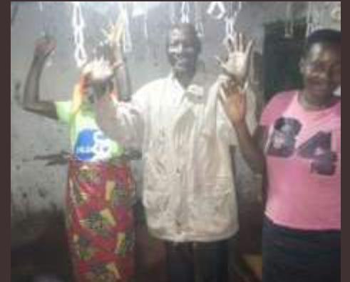
Burundi: Electrification of the parish complex, presbytery, and 60 local homes in Rwisabi and Kidasha