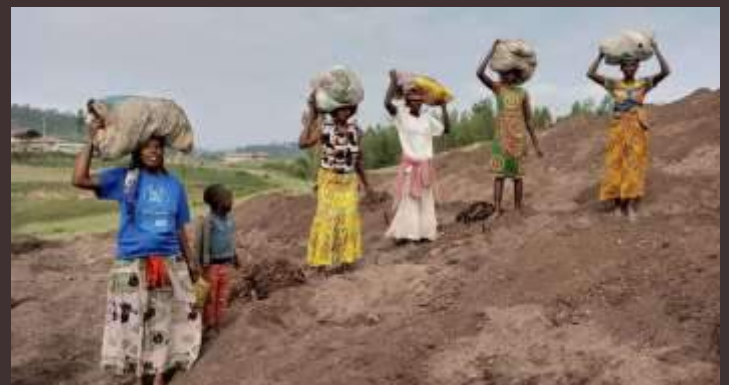
Rwanda: Extension of the coffee plantation at Gitare Parish