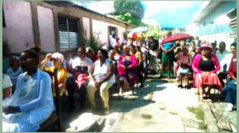
Cuba: Pastoral house with food program for local elderly population