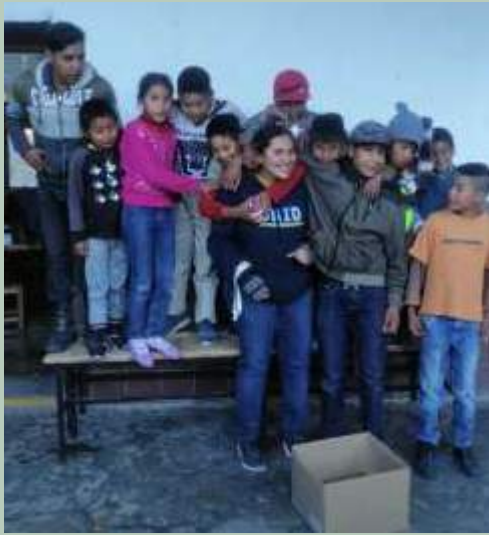
Mexico: Boy's hostel and health clinic renovation for the indigenous children at Sierra Tarahúmara Mission, Chihuahua