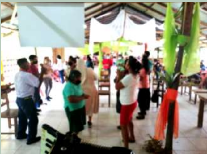
Costa Rica: Renovation of the parish hall and hostel