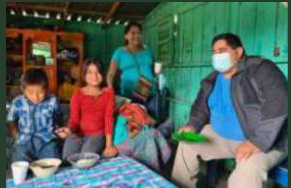
Central America: Food relief for families hit by COVID-19