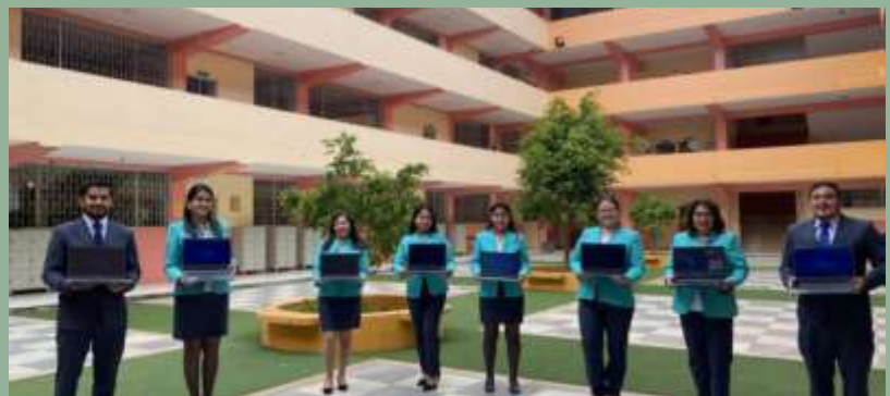
Ecuador: Computers for the Teachers at St. Vincent de Paul College