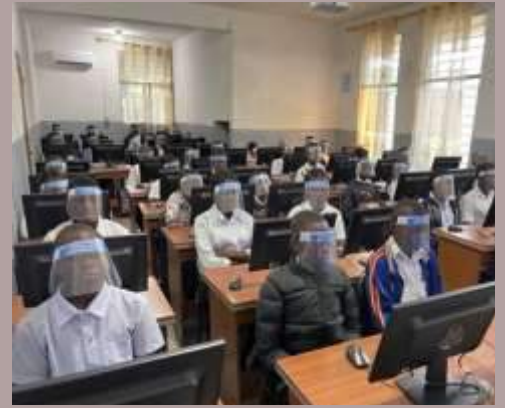
Democratic Republic of Congo: Computer lab for the Saint Vincent DePaul School Complex in Kinshasa