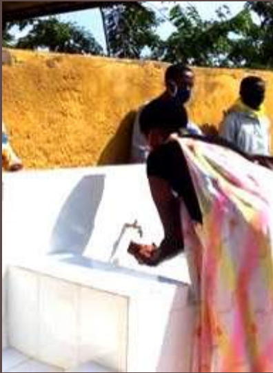
Rwanda: Installation of sanitary equipment including hand washing stations for the fight against COVID-19 for the church of the Mahama Refugee Camp