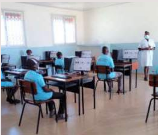
Mozambique: Computer Lab for Secondary School in the village of Chinhacanine