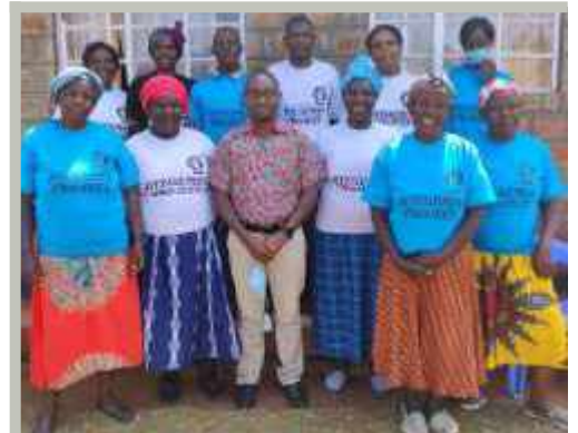
Group photo of participants from St. Kizito, Matisi Parish

another. They are encouraged to expand their businesses and continue to receive training on money management. Especially popular is the savings component of the loan administration. The participants have become more confident in their business activities and feel they will be more resilient when facing difficult times. They now have hope for the future.