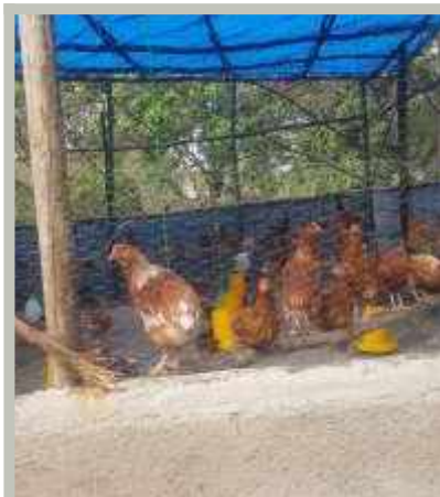
Egg laying hens in new chicken coop at the Parish of Alem Tena

generating income, this project will help improve food security for both the local poor and the local confreres.