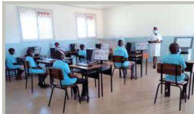
Computer room already set up with students and the computer teacher, explaining how to take care of computers.

The Vincentian Community was looking for ways to improve the opportunities for the young people in the area. With the help of the VSO, they were able to add a computer lab to the school. They purchased six computers, a tablet and a printer. A carpenter helped with tables and chairs. They employed an instructor and added computer studies to the curriculum. With their new computer skills, the graduates will have better prospects for employment. While still in the early stages, it is off to a good start and has enriched the curriculum for the 60 participating students.