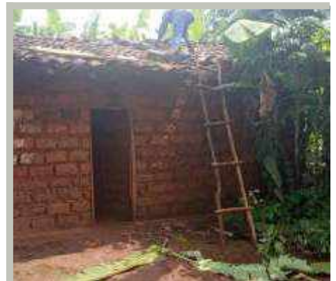
A local parishioner installing a household system

In Burundi, there was darkness, and now there is light.