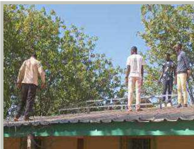
Installing the rooftop solar panels

The house now has light 24 hours a day. But one of the other big changes they realized was a time and cost savings on food. Now that they have electricity around the clock, they can run a refrigerator and freezer. This allows them to buy food in bulk quantities which are cheaper. The staff gets to spend less time shopping.