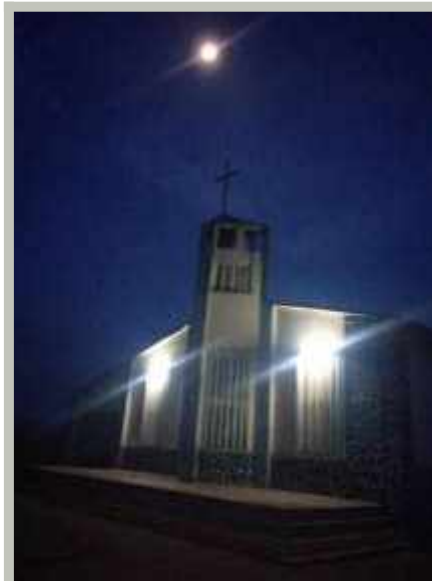
The Chapel with all lights on in the evening