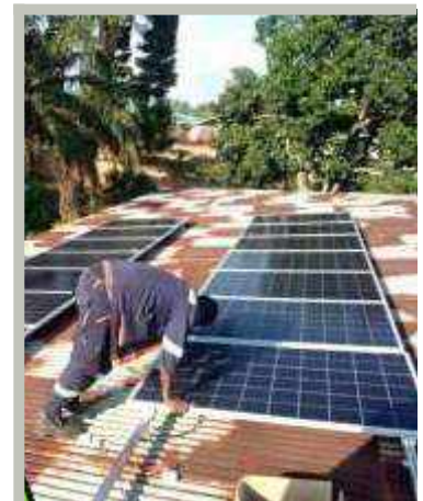
Rooftop install of solar panels for the Parish offices